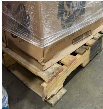
Without Pallet Grip

"Locks" your load to the pallet, preventing the products from sliding during transit.