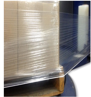
With Pallet Grip