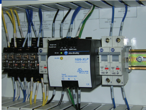
Allen-Bradley standard devices throughout the control enclosure to facilitate local sourcing.