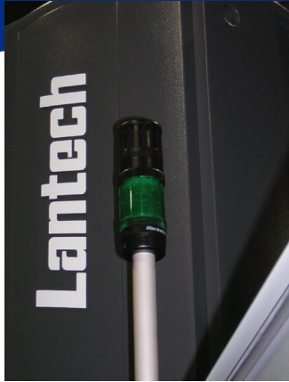
Allen-Bradley safety signal light and horn.